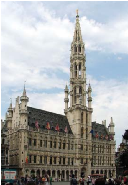
Figure 3. Brussels City Hall, 1420 © Alina Zienowicz

height of around 35 meters (115 feet), the early skyscrapers were about twice the normal height of typical buildings at the time. The second characteristic of the first skyscrapers is that these tall buildings were all built to provide space in which people could either work (offices) or live (residential buildings and hotels). Most of them were office buildings, with the exception of the Marshall Field Building, which was a department store, and the eight-story flats, which were residential buildings.