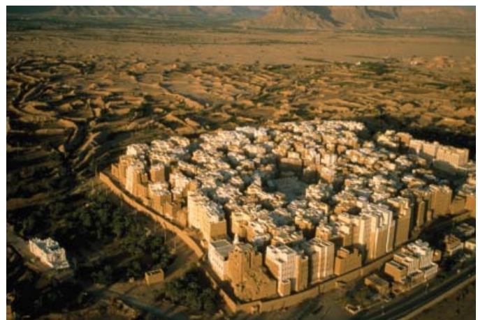
Figure 7b. Shibam, Yemen (2005)