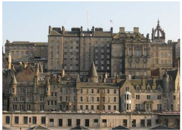
Figure 5. City Chambers, formerly the Royal Exchange (36 m /118 ft) in Edinburgh, 1753

nameless insulae in a fourth century guidebook to Rome. An earlier book, written by Tertullian in the 3 rd century, suggests that Insulae Felicula had 12 stories, a height that would most definitely make it a skyscraper. Unfortunately, there is no confirmation that these speculations are true because the building no longer exists and no archaeological evidence has been found of this building.