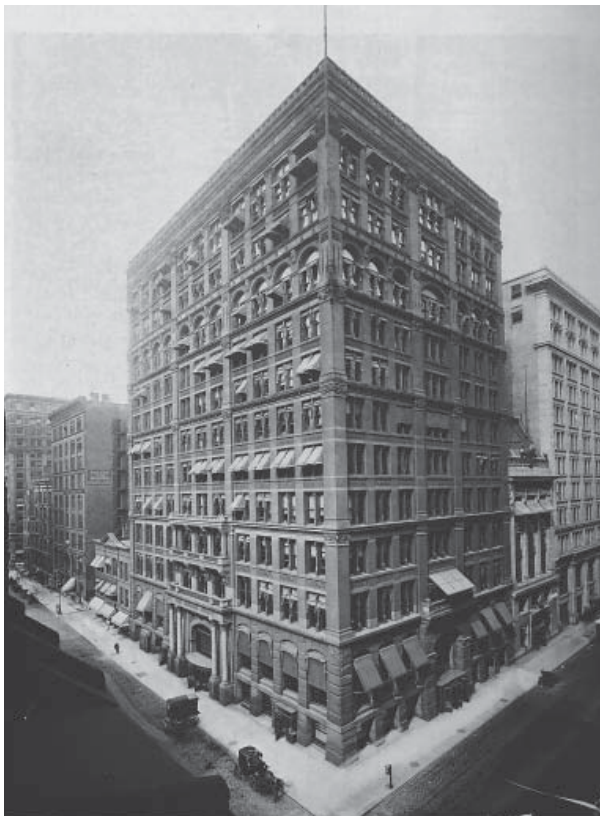
Figure 1. Home Insurance Building in Chicago (44 m/144 ft), 1885

These buildings called skyscrapers had a couple of characteristics in common. The first important characteristic was their height. With at least six or seven stories and a minimum