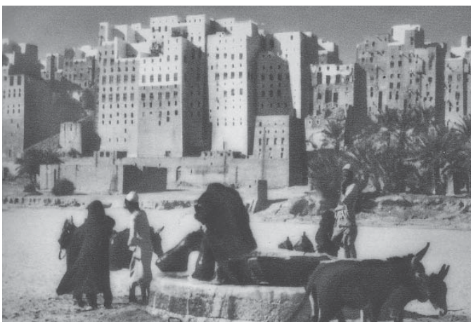
Figure 7a. Shibam, photographed by Hans Helfritz during his travels. At least one of the houses in this picture has 12 floors © Hans Helfritz, Chicago der Wüste (1932)

The Midland Grand Hotel at London's St. Pancras Station was completed in 1976 and was presented as Europe's most modern hotel. Part of the hotel was a 76-meter (249-foot) tall tower above one of the entrance gates to the station. The tower had eight or nine floors and the rest of the hotel had six. Ascending chambers (hydraulic lifts) were available to guests to reach the upper floors. By this time, Londoners were used to buildings with tall towers such as the Houses of Parliament. Therefore, the Midland Grand Hotel was just another tower and there was no need to introduce a new word for this high, multi-story building (see Figure 8a & 8b).