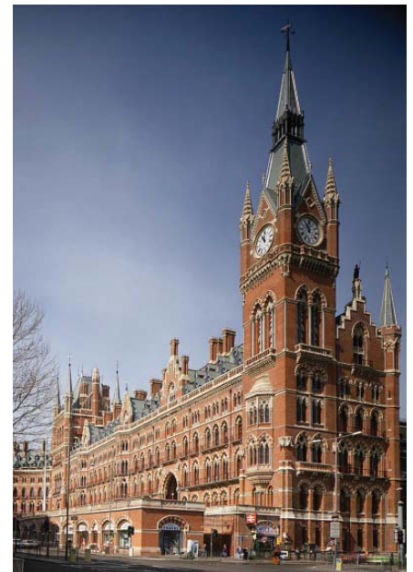
Figure 8b. St. Pancras Station, London.

The Midland Grand Hotel was built in the same period as New York's Tribune and Western Union buildings. Its inspiration, however, did not come from New York's skyscrapers but rather from Belgium's old City Halls. It was an independent start of England's skyscraper history, American influence would come later.