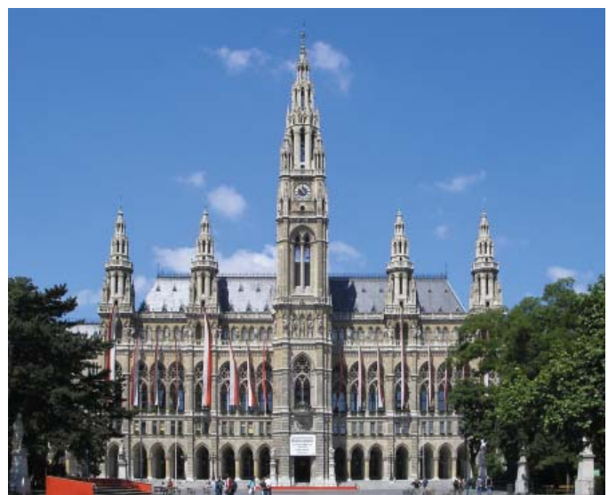
Figure 4. Vienna City Hall, 1883

Possibly the tallest among Rome's insulae was the Insulae Felicula. It must have been a special building as it was the only insulae mentioned by name out of thousands of